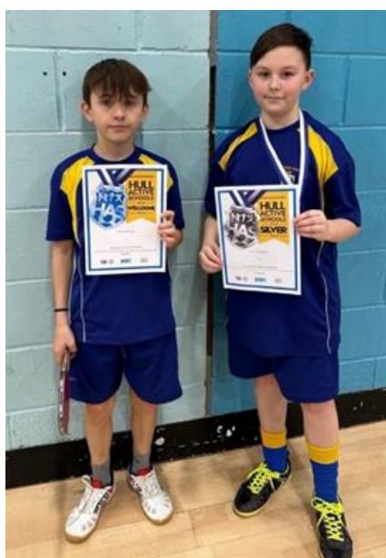
Table Tennis - Further success has been seen in table tennis, where two of our Y8 boys represented the school in the regional finals, both finishing within the top 4 places.